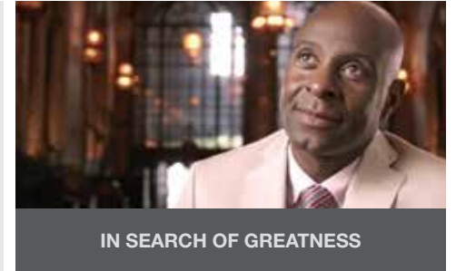
IN SEARCH OF GREATNESS

This critically acclaimed gem, shot in stark black and white, tells a lean, but emotionally impactful love story: in post-war Poland, a music director and singer with vastly different backgrounds and temperaments fall in love though they are fatally mismatched.