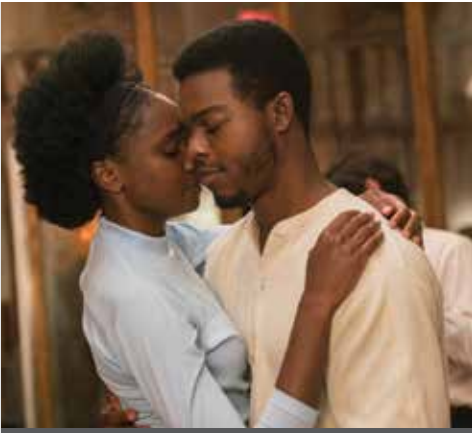
IF BEALE STREET COULD TALK