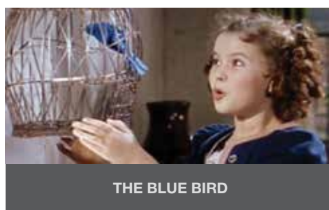
THE BLUE BIRD

Berylune the fairy sends a bratty, selfish woodcutter's daughter (Shirley Temple) and her brother on a magical journey through time to search for the bluebird of happiness.