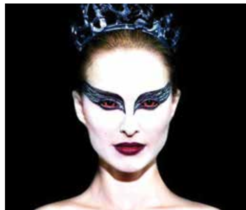
Black Swan – May 17