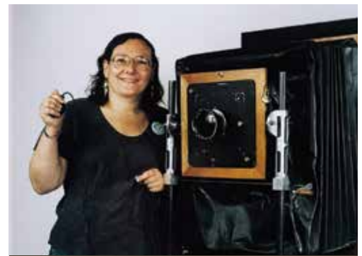
The B-Side: Elsa Dorfman's Portrait Photography – June 29-July 2

In 1979, after the Air Force closes a section of Area 51, all materials are transported to a secure facility. A train carrying some of the materials derails and something escapes from one of the cargo cars. A group of kids making movies with their super 8 cameras accidentally capture what escapes on film.