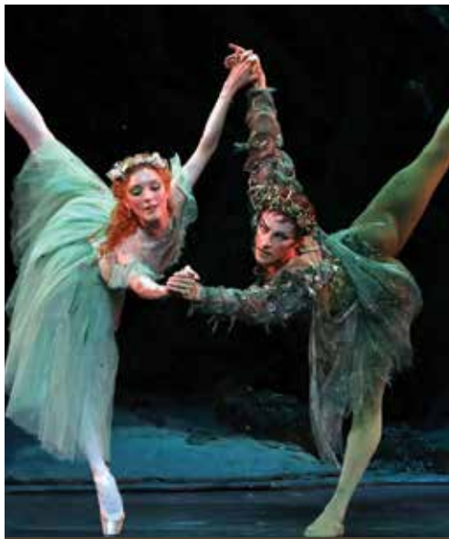
The Dream – June 24

“After the intimacy of Before Midnight and Boyhood , writer/director Richard Linklater here returns to the kind of freewheeling dramedy with which he made his name in the early '90s. Everybody Wants Some!! is, in fact, a “spiritual sequel” to his '93 classic Dazed and Confused , with both movies disposing of plot to instead offer anthropological studies of teens in Texas – drugs, sex and rock ‘n’ roll. But where Dazed was set in 1976 over a 24-hour period as high school let out for summer, Everybody takes place in 1980 during the first three days at a fictitious college.” Total Film