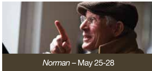
Norman – May 25-28