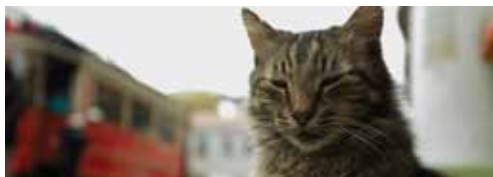
Kedi – May 11-14

In 1949, Laura Brown, a pregnant housewife, is planning a party for her husband, but she can't stop reading the novel Mrs. Dalloway . Clarissa Vaughn, a modern woman living in present times is throwing a party for her friend Richard, a famous author dying of AIDS. These two stories are simultaneously linked to the work and life of Mrs. Dalloway author Virginia Woolf.