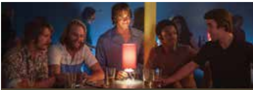
Everybody Wants Some!! – June 22-25