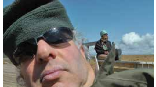
100 Short Stories – May 30