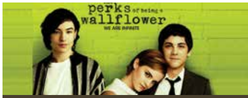
Perks of Being a Wallflower – May 3