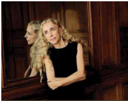
Franca: Chaos and Creation – June 22-25