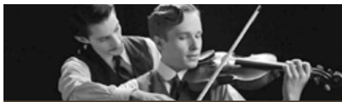
Frantz – May 4-7

Socially awkward teen Charlie is a wallflower, always watching life from the sidelines, until two charismatic students become his mentors. Free-spirited Sam and her stepbrother Patrick help Charlie discover the joys of friendship, first love, music and more, while a teacher sparks Charlie's dreams of becoming a writer. However, as his new friends prepare to leave for college, Charlie's inner sadness threatens to shatter his newfound confidence.