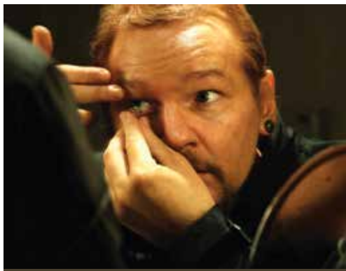
Risk – May 19-21