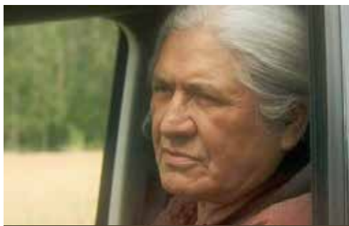
Hank Williams First Nation – June 21