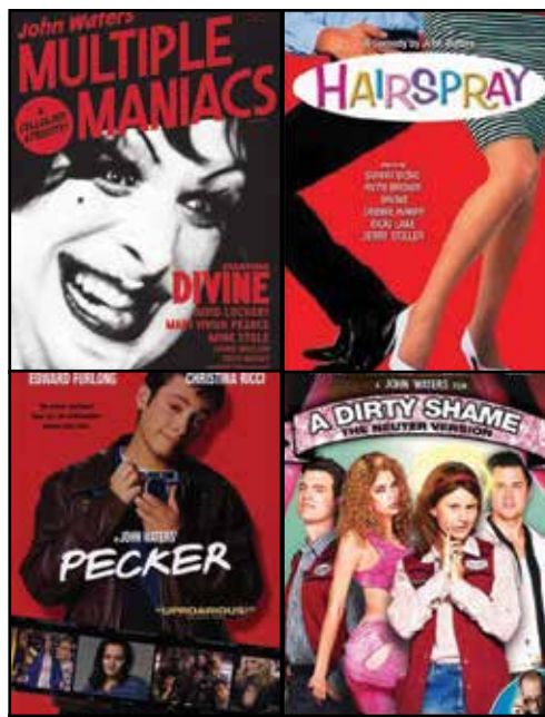
Camp, Trash and Filth – June 14-23