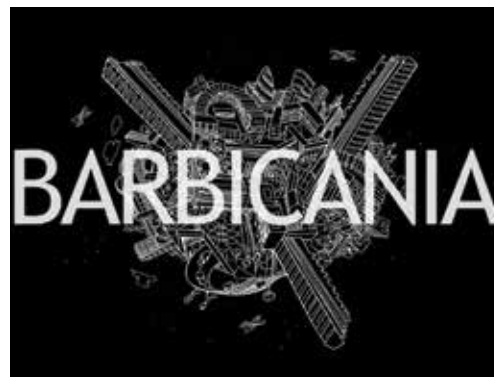
Barbicania – May 18

A committed dancer wins the lead role in a production of Tchaikovsky's Swan Lake only to find herself struggling to maintain her sanity.