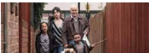
I, Daniel Blake – June 8-11

In this modern love story set against the Austin, Texas music scene, two entangled couples – struggling songwriters Faye (Rooney Mara) and BV (Ryan Gosling), music mogul Cook (Michael Fassbender) and the waitress whom he ensnares (Natalie Portman) – chase success through a rock 'n' roll landscape of seduction and betrayal.