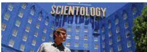
My Scientology Movie – May 11-14

Hundreds of thousands of Turkish cats freely roam the metropolis of Istanbul. Over thousands of years they've become an essential part of the communities that make the city so rich. Claiming no owners, the cats of Istanbul live between two worlds, neither wild nor tame – bringing joy and purpose to those people they choose to adopt.