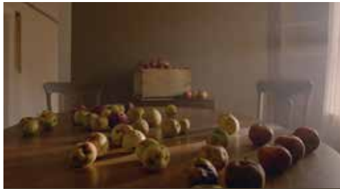
God Knows Where I Am – May 18-21

“Sometimes all a documentary needs to do is to get us in the room with somebody we’re curious about. Laura Poitras did this, and a lot more, in Citizenfour , by taking us to meet US whistleblower Edward Snowden; she pulls off the same trick in Risk , a film which tracks WikiLeaks founder Julian Assange and his team between the summer of 2011 through to the present day. The film includes extensive footage shot inside the Ecuadorian embassy in London, where the Australian journalist and cyber-activist, under order of extradition to Sweden for questioning on allegations of sexual offences, was granted asylum in August 2012.” Screen Daily