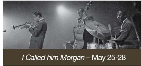
I Called him Morgan – May 25-28

Alice Howland, happily married with three grown children, is a renowned linguistics professor who starts to forget words. When she receives a devastating diagnosis, Alice and her family find their bonds tested.