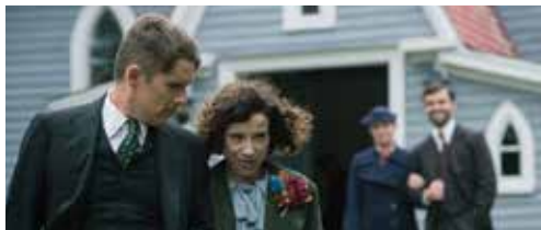
Maudie – June 2-4